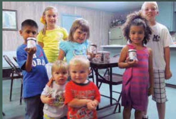
Hagansport Children's Ministry

Children and adults from 16 congregations as well as 13 individuals have raised over $12,000 to purchase books for the library. Thank you for not just reaching our goal, but doubling it!